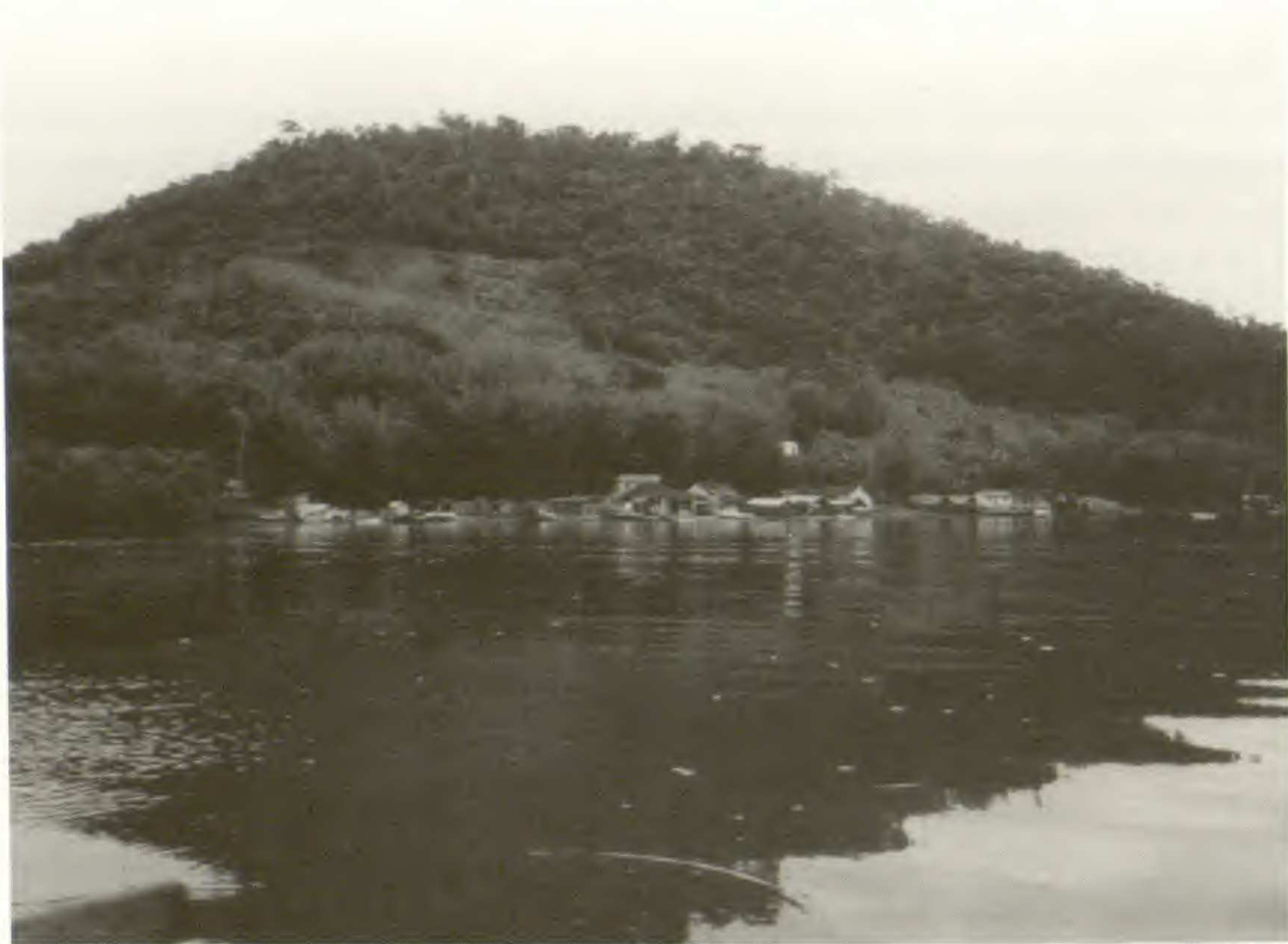
FIGURE 2.—Itacuruçá Island.

Itacuruçá Island includes about 50 fishermen's houses, representing 21% of all the houses (Hoefle 1989). Temporary residents own the majority of the island's houses. Gamboa has survived as an artisanal fishing community on Itacuruçá probably because of its location next to a mangrove forest, an area usually avoided by tourists. Most Gamboa residents (33 out of 45) were born here. Illiteracy (including functional illiteracy) is relatively low (26%) compared to other communities and to other Brazilian rural areas (Begossi 1992a). Illiteracy is in general lower in the more developed southeast of Brazil than in other Brazilian regions. Gamboa literacy rates are high compared to those of more isolated communities of the Atlantic Forest coast, such as Búzios Island, where 53% are illiterate (Begossi 1996). Economic activities at Gamboa are essentially fishing, tourism, and some agriculture.